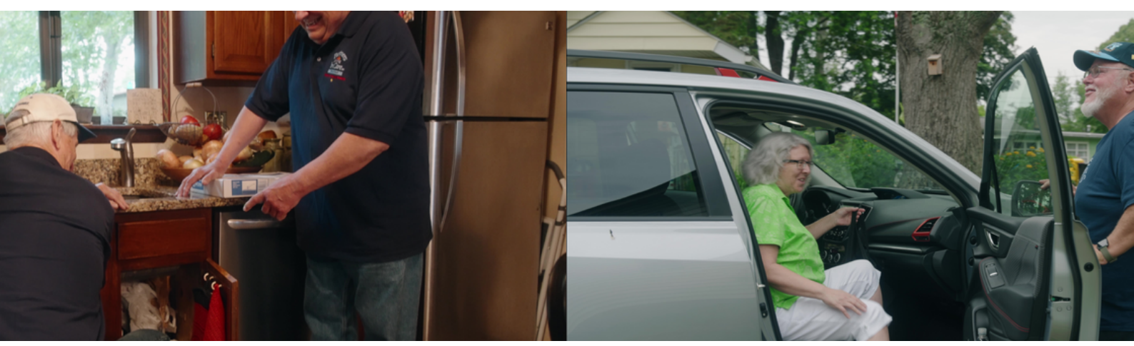
Photo on the left shows Partners In Care's Repairs with Care program's home maintenance and repairs. Photo on the right shows Partners In Care's Ride Partners program provides arm-in-arm, door-through-door transportation to appointments.

Over the course of our 30+ years, PIC has encountered various challenges, the most recent being the COVID-19 pandemic. Despite the pandemic's many hurdles, our dedicated staff and supportive community of members played a crucial role in maintaining a close connection throughout the shutdown. Thanks to their commitment, we were able to provide services safely and adapt to the circumstances.