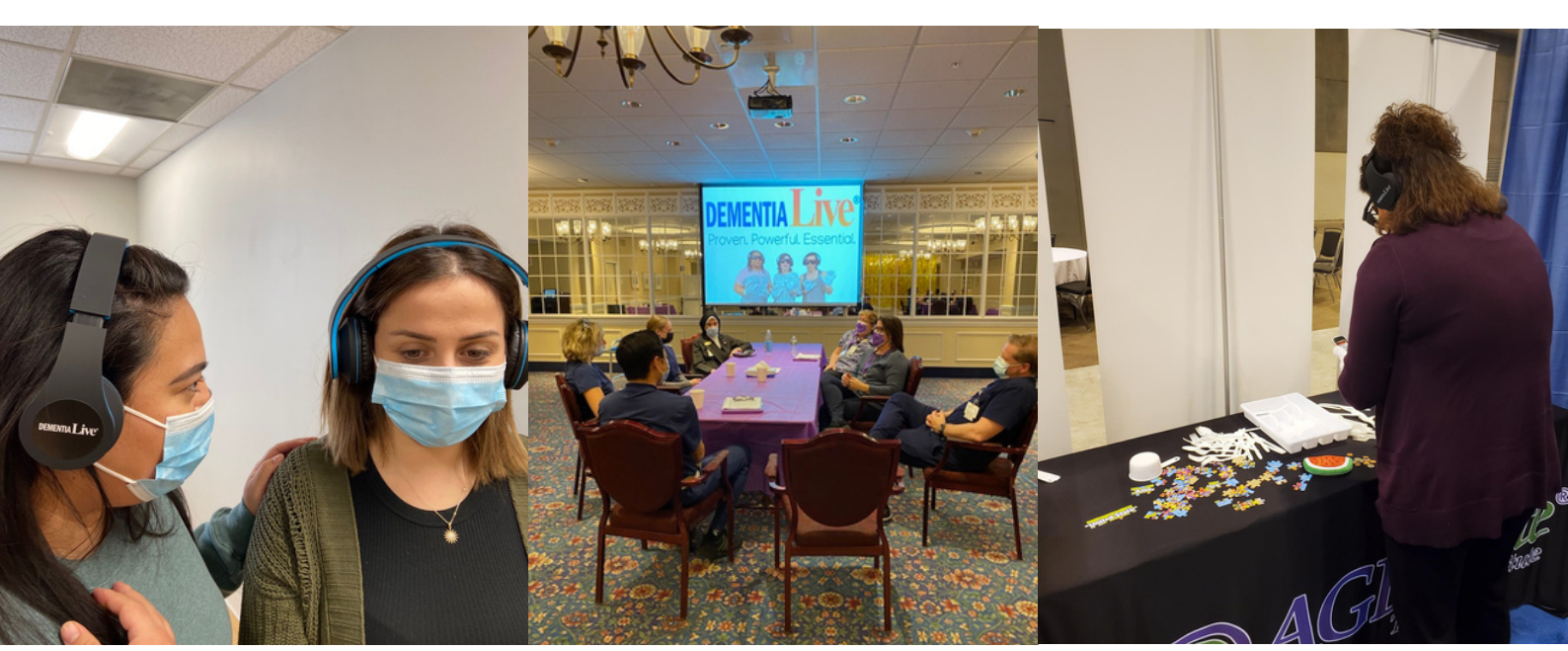
Series of provided photos of participants engaging with the Dementia Live training

Impact and efficacy: During the contract term, NCTCOG has conducted training for 93 home-delivered meal staff members and volunteers relative to its output goal of 100 participants. The purpose of the training is to increase participants' understanding of dementia and awareness of community resources.