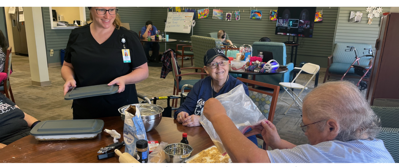
Photo of the Midland Care PACE Center in Emporia, Kansas.

departments, senior centers, and aging and disability resource centers have proven successful in identifying and bringing PACE services to individuals in those areas.