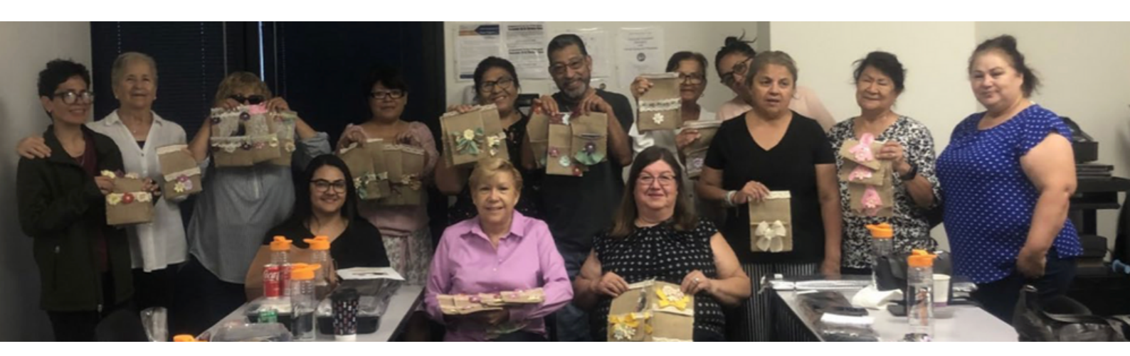
Provided photo of participants showcasing the outcomes of a craft project.

Our first task in each region was to establish local advisory committees with multisector representation from local government, elected officials, health systems leaders, area agencies on aging, independent living centers, community-based organizations, and other key stakeholders. In Northern California, the DAN coalition was already an established leader, and they were able to hit the ground running in January. The coalition in the Inland Empire experienced a change in leadership in 2020 that coincided with the beginning of the COVID pandemic, and it was challenging to rebuild momentum in that region. Fortunately, a leader of the Inland Caregiver Resource Center stepped up to volunteer as co-chair, taking on considerable responsibilities to engage key stakeholders. In Kings and Tulare Counties, staff turnover at the start of the project meant the advisory committee was delayed in their launch until May 2022.