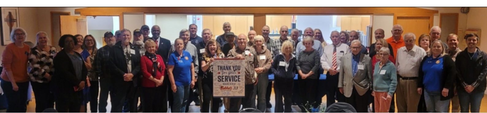
Partners In Care's special event honoring our Veterans Helping Veterans members.

We serve six Maryland counties, four that are recognized as rural, and are positioning PIC for expansion throughout the state and ultimately nationwide.