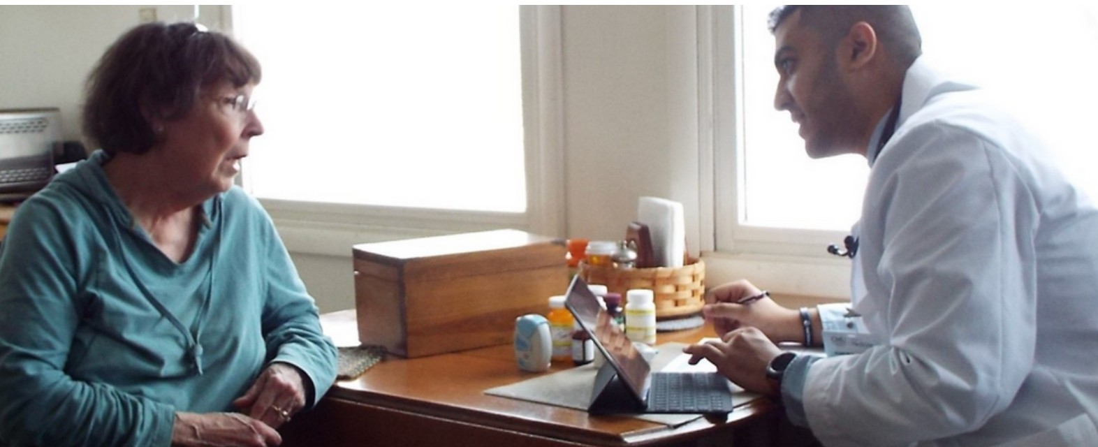
Provided photo of CMU medical student takes relevant medical history from Mid-Michigan patient during a Healthy Aging home visit.

Project INCLUDE includes mechanisms to detect lack of social connectedness and identify loneliness and isolation, as well as additional individualized screenings for perceived causes of loneliness. We develop individualized care plans with peer and external support to increase social connectivity, such as older adult peer support groups, socialization, education, and empowerment to create social connections with the help of trained professionals and students in social work, medical, and recreation therapy fields. We develop and strengthen local networking with systems of care to help prevent mental health and other issues linked to loneliness and isolation.