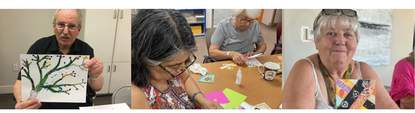
Series of provided photos of participants engaging in creative projects.

Community input was gathered through dozens of focus groups engaging providers, older adults, adults with disabilities, and caregivers. Relationships were formed and expanded with providers and cultural institutions to engage participants representing diverse geographies and perspectives, such as LGBTQ+, American Indian, Black, Latinx, Hmong and Mien populations, veterans, farmworkers, wildfire survivors, and those who were low-income, unhoused, or formerly incarcerated. In some cases, new advocates were identified through the focus groups and invited to join local advisory committees.