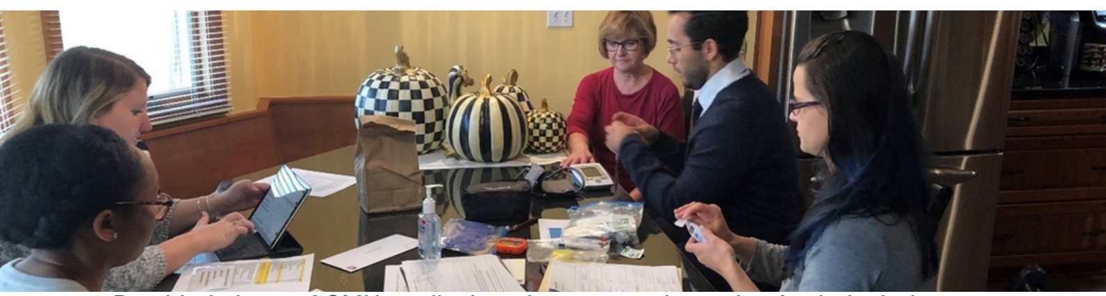
Provided photo of CMU medical student team take patient's vitals during Healthy Aging home visit.

The Home Visit and Health Improvement Program is an innovative and cost-effective approach to providing preventative health care services and improving health outcomes. Evidence suggests preventative health care (as provided by CMU) and sustained support by a community partner (CoA) improves health and reduces morbidity and mortality rates. This approach includes health professions students who assess older adults' health needs and expand and strengthen the workforce, possibly increasing the likelihood of students specializing in geriatrics. One impact will be more professionals trained and experienced in working with older adults, leading to improved health outcomes.