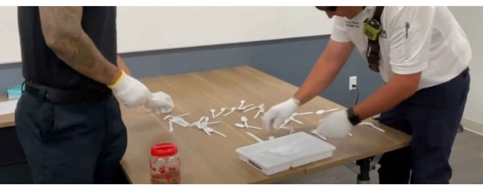
Provided photo with first responders participating in a training.

A pivotal aspect of Dementia Live's success lies in its commitment to sustainability. The program extends its influence by conducting train-the-trainer sessions, empowering leaders in rural areas to perpetuate dementia training within their local communities. This approach ensures an enduring framework for providing support and care to individuals living with dementia and their care partners.